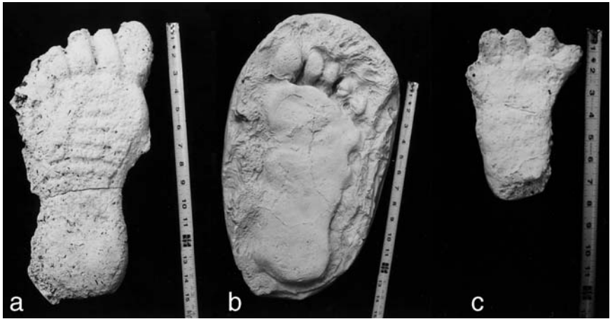
Fig. 3. Casts of sasquatch tracks. 3a. Vancouver Island, BC, 1988 (15 inches long, 6 inches wide); 3b. Washington State, 1982 (15.5 inches long, 6 inches wide); 3c. Washington State, cast of juvenile sasquatch track (7 inches long, 5 inches wide; note slightly abducted big toe).